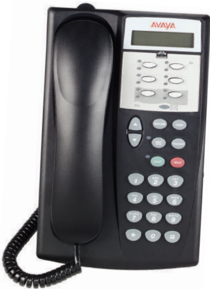
Four telephones and a 4-mailbox messaging solution are included with the PARTNER Small Office Edition.

When it comes to communications, there's no such thing as a small business. With the right communications capabilities, even a one-person firm can compete successfully with much bigger businesses.